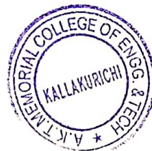
PRINCIPAL A.K.T.MEMORIAL COLLEGE OF ENGG. & TECH KALLAKURICHI

This standard policies & procedure manual has been prepared by adopting AICTE/NBA/NAAC/ANNA UNIVERSITY/NIRF/AISHE norms along with HR initiatives and suggestions received from all the stakeholders. The manual has been reviewed by the management and approved by the Governing Council Body (GCB) of the college during its meeting held on 18.05.2023 . This policy manual should be implemented scrupulously by ALL THE STAKE-HOLDERS to ensure quality assurance and continuous growth. All stakeholders should strive to improve and make innovations to this policy manual particularly concerning good practices and may recommend them through Management. The Management as per necessity, practicality or otherwise may observe these policies with slight changes if required. But that should be presented to the Governing Council Body in its next meeting for ratification. This “Policies Manual Document” is referred to as “AKTMCET STANDARD POLICIES AND PROCEDURE MANUAL”.